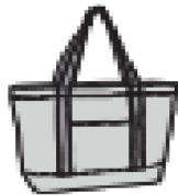
TINTED PLASTIC TOTE