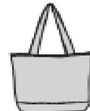
NON-CLEAR MERCHANDISE BAG