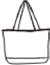
12" X 6" X 12" CLEAR TOTE