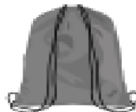
SOLID OR CLEAR DRAWSTRING BAG